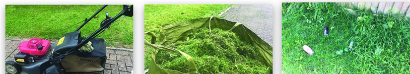
Remembrance garden project

FULL INDUCTION, TRAINING & SUPERVISION PROVIDED